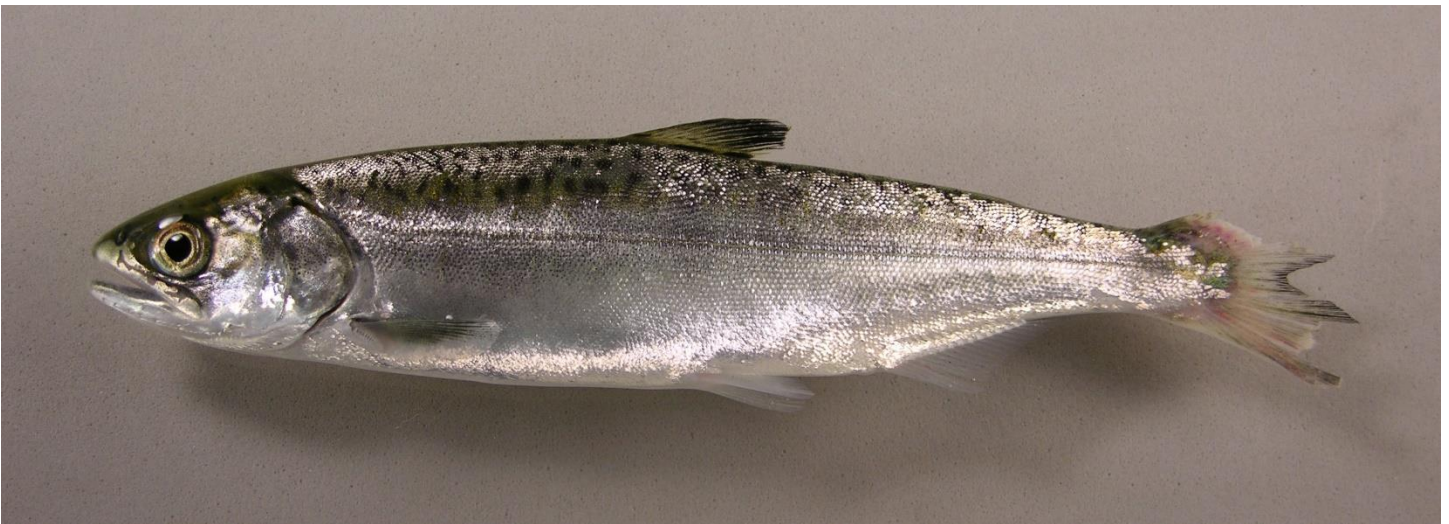
Hatchery origin Subyearling Fall Chinook smolt ( Oncorhynchus tshawytscha ), approximately 120 mm fork length, showing a severely eroded caudal fin, sampled at the John Day Dam Smolt Facility on 5 July, 2024.