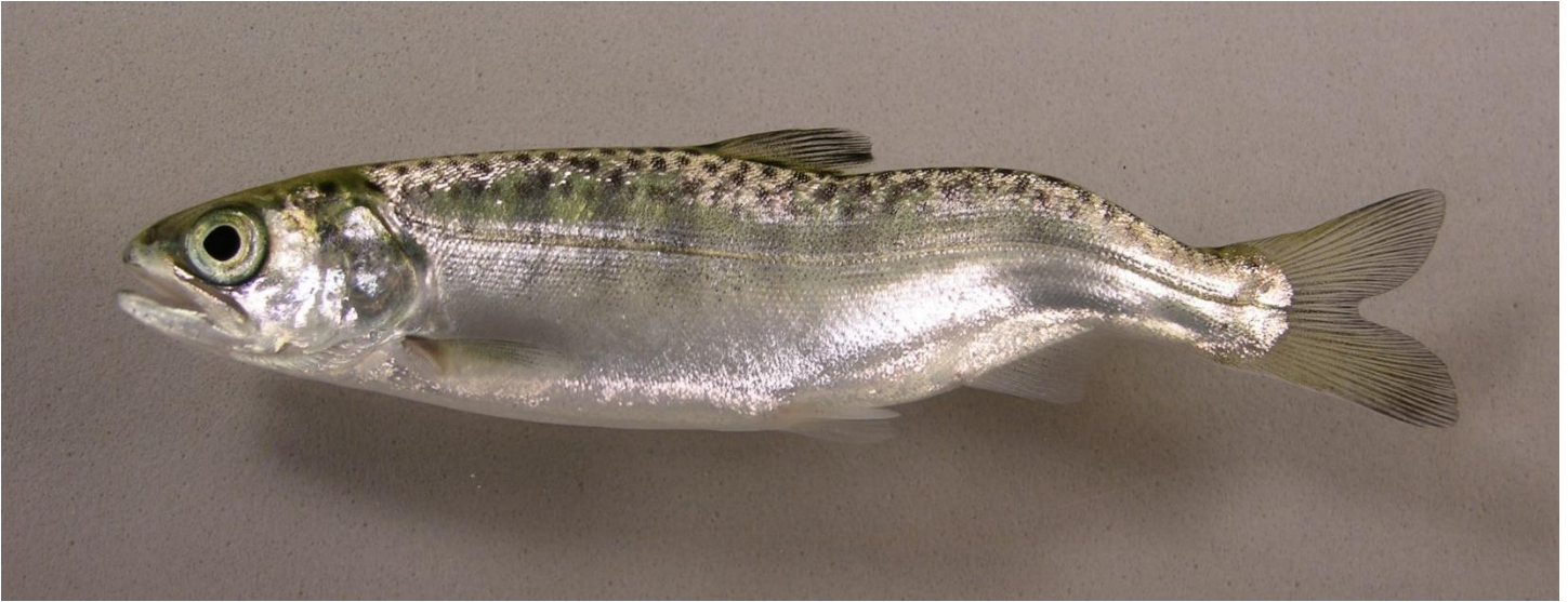
Hatchery origin Subyearling Fall Chinook smolt ( Oncorhynchus tshawytscha ), approximately 105 mm fork length, showing a curved spine deformity, sampled at the John Day Dam Smolt Facility on 5 July, 2024.